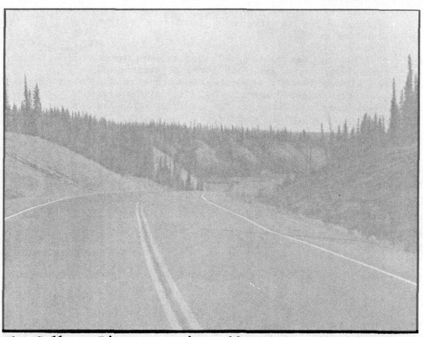
The Gulkana River crossing offers memorable expansive views of the river lowlands and the Wrangell Mountains beyond.

There is a large amount of land use activity concentrated within this unit. Recreational activities are popular at both the Gulkana River